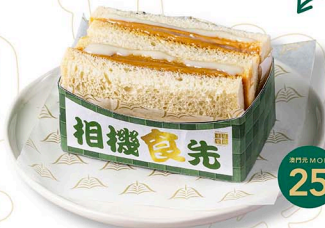
鮮油多士 Toast with Butter