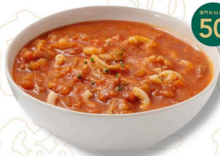
羅宋湯通粉 Macaroni in Russian Borscht