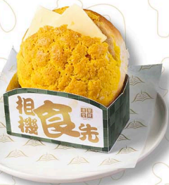
招牌芝士鹹牛肉蛋軟豬 Waso Soft Bun with Cheese, Corned Beef and Egg