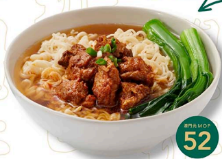
五香肉丁公仔麵 Instant Noodles with Five-spice Pork Cubes