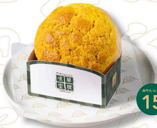
鮮油菠蘿包 Pineapple Bun with Butter