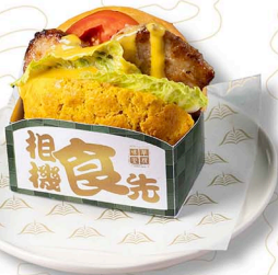
菠蘿包 Pineapple Bun