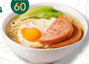
所向無敵餐蛋麵 Luncheon Meat and Egg Noodle Soup