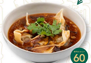
酸酸辣辣湯雲吞 Pork Dumplings in Sour and Spicy Soup